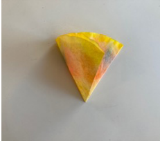
C. Fold the other side over, covering the first side to make a triangle