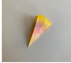
D. Fold the triangle in half again