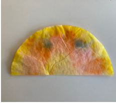
A. In half