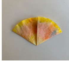
B. Fold one side toward the center