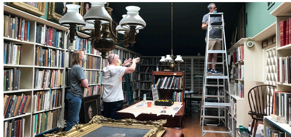
ART ROOM RENOVATIONS