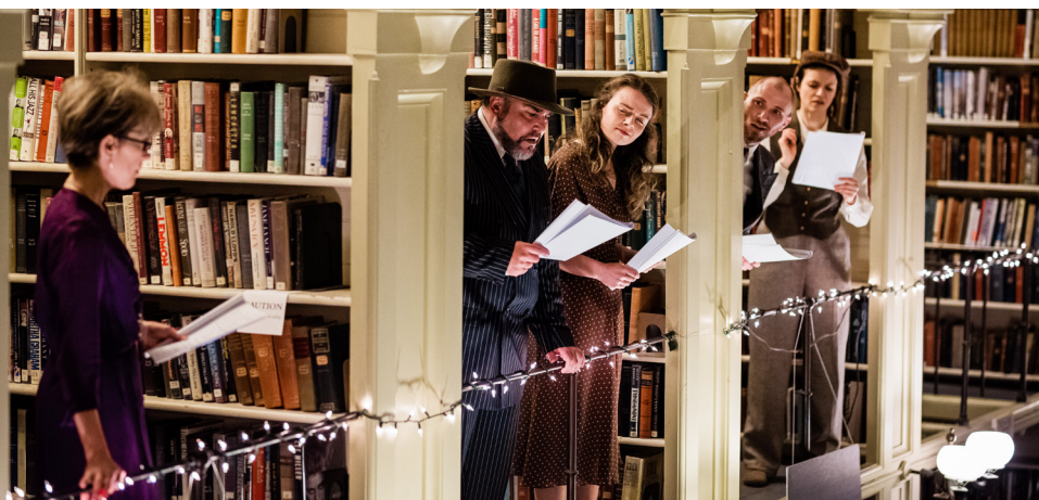
A LIVE RADIO THEATER PRODUCTION PERFORMED BY THE WILBURY THEATRE GROUP AT A MYSTERIOUS AFFAIR