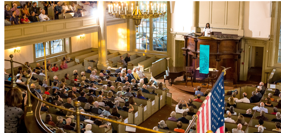
COLSON WHITEHEAD ADDRESSES A SELL-OUT CROWD